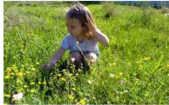
Wildflower meadow/Long grass